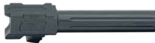
FLUTED & POCKETED MATCH BARREL