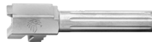
FLUTED MATCH BARREL