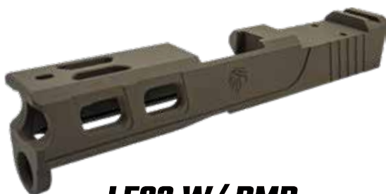
LF23 W/ RMR