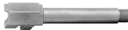
THREADED MATCH BARREL