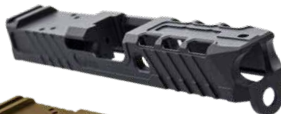
LF22 W/ RMR